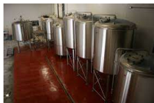
Above and below are urethane Coated floors. There are many Color options with these coatings.

You have 2 basic options*, and sealed concrete shouldn't be one! The first would be an industrial coating. These would consist of either an Epoxy floor coating, or an Urethane floor coating. The cost of these options can vary greatly depending on the exact coating that you are talking about. Typically epoxy coatings are less costly, yet have a shorter service life, typically 4-7 years. Urethane coatings tend to be more expensive and have a longer service life, of 7-10 or more years. However, each of these examples have a limited service life as they are both susceptible to wear, scratching and chipping. They also both can suffer from fading color and constant change in appearance. Repairing either of these surfaces is possible, however, repairs will never match. Point loading capabilities of the floor are not affected by these options. The second option is a proper Fully Vitrified Tile floor. These tiles are engineered to be extremely durable, and can carry extreme loads. They are completely unaffected by the beer/chemicals that will be on the floor and they don't wear or lose their color. This type of flooring systems will last the life of the building, 20, 30 50 years and more should be expected. Because of the tile thickness and its shape, the point load capability of the floor is increased by these tile floors. There are multiple surfaces available for areas that need extra slip resistance.