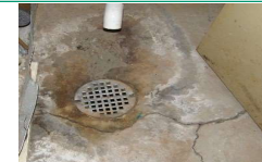
Above: Two examples of the common failures of coated floors. Chemicals have attack the drain area on the right, and movement of the concrete slab has made the coating crack and fail. These issues will do nothing but get worse over time.