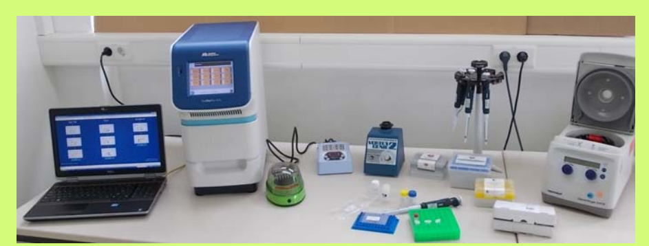
Minimum instrumentation and bench space needed to do PCR analysis

A4: Besides a thermocycler instrument, basics include a small centrifuge, microliter pipettes, and a heating block. Total investment costs start at approximately 15,000 US $